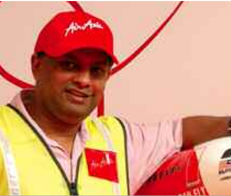
DATO' TONY FERNANDES Group Chief Executive Officer

Details of Dato' Tony Fernandes are disclosed in the Directors' Profile on page 30 of this Annual Report.